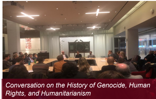
Conversation on the History of Genocide, Human Rights, and Humanitarianism