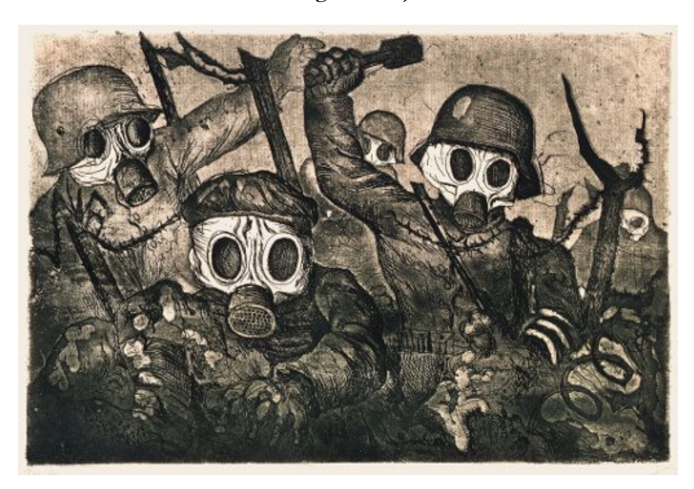
Otto Dix, "Storm Troopers under Gas Attack" (1924)